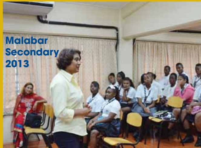
Malabar Secondary 2013