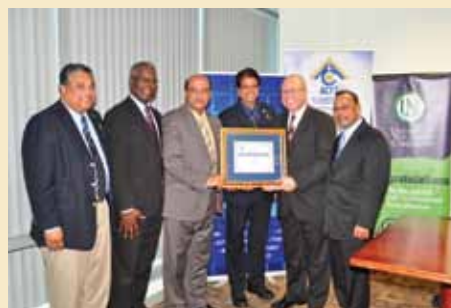
The University of the Southern Caribbean receives receives a certificate of Institutional Accreditation from ACTT