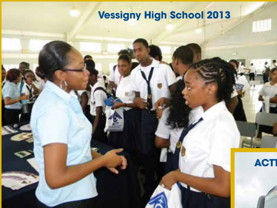
Vessigny High School 2013