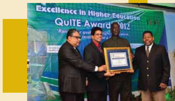
Cipriani College of Labour and Co-operative Studies receives receives a certificate of Institutional Accreditation from ACTT