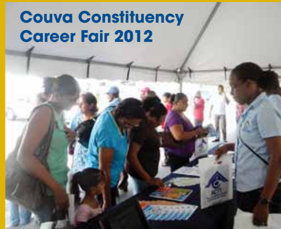
Couva Constituency Career Fair 2012