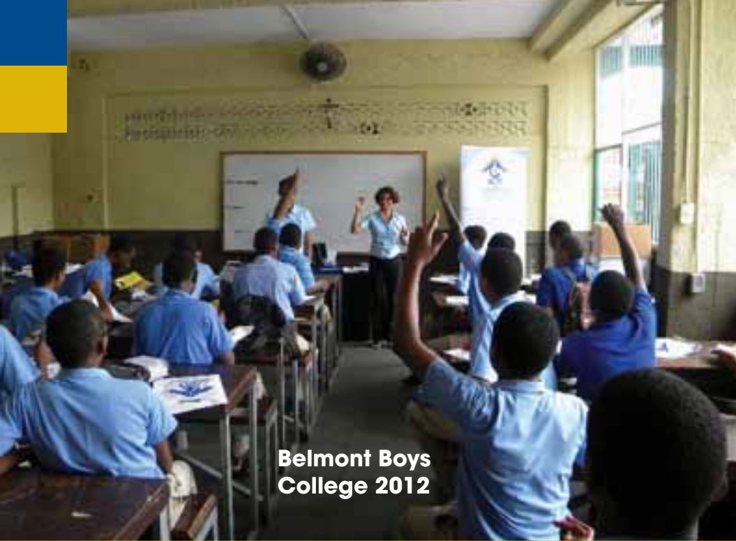
Belmont Boys College 2012