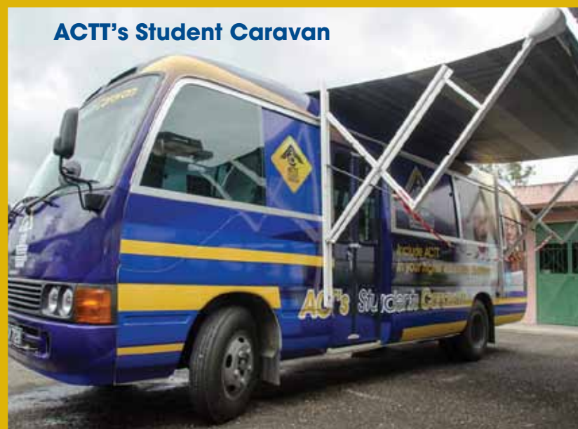
ACTT's Student Caravan